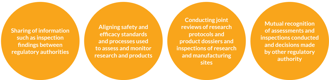
FIGURE 1 The what and why of regulatory harmonization

To address these barriers and accelerate access to safe and effective products, many countries in Africa are working together to harmonize regulation. Harmonization efforts help to address the lack of adequate financing and technical expertise faced by many countries in Africa by pooling resources (both technical and financial), sharing information, and increasing collaboration across countries to ensure the efficient evaluation of technologies. Harmonization activities can take many forms and encompass a broad spectrum of joint and shared undertakings, ranging from information sharing between NRAs, to joint inspections and protocol reviews, to convergence of standards and processes, to mutual recognition of product safety and efficacy. Harmonization efforts aim to decrease the time to register essential medicines, to treat priority diseases and reduce duplication of efforts through collaboration between partner states' NRAs. Even the most promising health technologies will not have impact if they cannot reach those in need due to regulatory barriers. Regulatory harmonization is critical in accelerating the development and delivery of lifesaving health technologies , including new tools to address PRNDs and new tools to prepare for future epidemics.