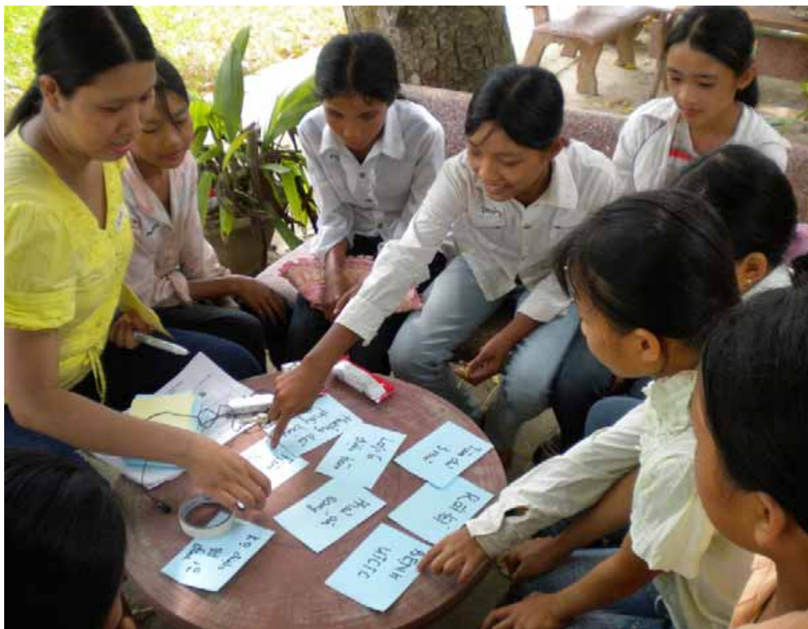
Fully vaccinated girls during a focus group discussion in midterm evaluation.

In consultation with NIHE and NEPI, two districts were selected in Thanh Hoa province (Nong Cong and Quan Hoa) and two districts in Can Tho city (Ninh Kieu and Binh Thuy) for vaccination. The selection was based on multiple criteria, including: cervical cancer disease burden, geography, socioeconomic status, EPI performance, population size, and staff capacities. The following sections present a description of the project design and implementation as well as findings from the evaluation.