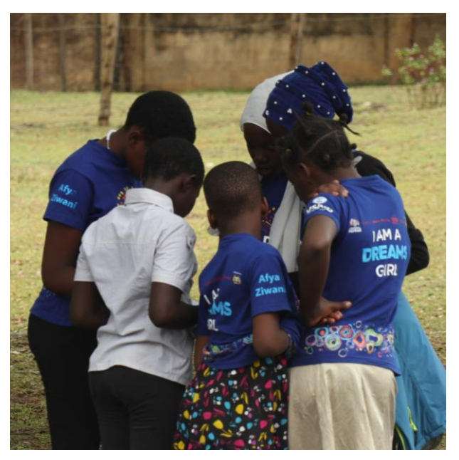
Above: Adolescent DREAMS girls consult at a safe space.

Key HIV prevention efforts under APHIAplus and Afya Ziwani have included voluntary medical male circumcision (VMMC), pre-exposure prophylaxis (PrEP), and social and behavior change (SBC) interventions to create demand for health services, promote healthy practices, and address harmful gender and sociocultural norms through small group and one-on-one sessions using evidence-based behavioral interventions (EBIs). These EBIs include My Health My Choice, SHUGA, Splash Inside Out, Sister to Sister, Families Matter! Program, and Healthy Choices for a Better Future. To support demandgeneration for HIV prevention services, PATH has worked through existing community structures, including community health extension workers as lead mobilizers at facilities, and with community health volunteers, peer educators, female champions, satisfied clients, and HIV testing service providers as additional mobilizers.