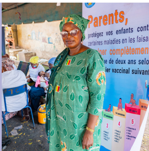
A health worker stands in front of an education sign intended to improve vaccination uptake.

In the first year of the project, the team laid the foundation for conducting SBC qualitative research in Bamako and Koulikoro districts. Digital Square led active engagement with several partners to determine appropriate and impactful research to drive demand for immunization and enhance the project's SMS gateway adaptation. Ultimately, MOHSD and DRIVE Demand Mali agreed on three activities: