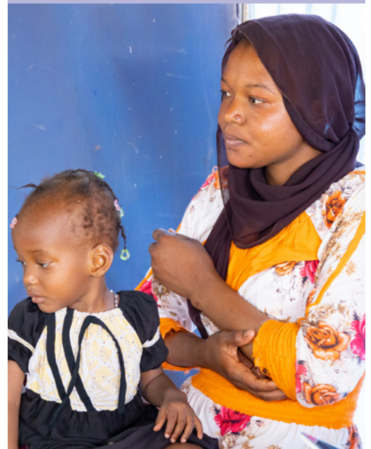
DRIVE Demand aimed to understand and improve vaccine confidence among caregivers of children.

To understand hesitancy and inform SBC messaging, DRIVE Demand enlisted the Busara Center for Behavior Economics to conduct behavioral research in four locations across the DRIVE Demand project: Bamako, Mali; Dar es Salaam, Tanzania; Kampala, Uganda; and Lusaka, Zambia. The study was designed to use focus group discussions to gather information on three populations: adults who had not received the COVID-19 vaccine in the past year; pregnant people who had not received the COVID-19 vaccine in the past year; and health care providers who delivered vaccinations. In Mali, at the request of MOHSD, Busara also included focus group discussions for caregivers of children under two years of age. Focus group discussions occurred in Bamako in April 2024. Findings across the four countries are presented in Dynamics of Vaccine Hesitancy: A Practitioner Playbook . 3