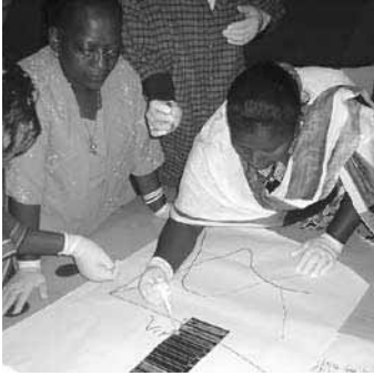
Health care providers practicing rapid HIV testing in one of the trainings organized by PATH in Arusha, Tanzania.

We have also worked to obtain support and input from government and private health facilities for a national TB–HIV advocacy, communication, and social mobilization strategy, which we are developing with the government of Tanzania. In addition, we have developed assessment tools to determine whether private-sector facilities have the capacity to provide TB services and to identify the upgrades and inventory needed in public-sector diagnostic laboratories.