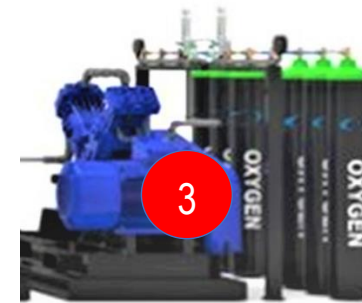
Filling ramp, with manifold

Disclaimer: This document was made possible with support from the United States Agency for International Development funded RISE program, under the terms of the cooperative agreement 7200AA19CA00003. The contents are the responsibility of the RISE program and do not necessarily reflect the views of USAID or the United States Government