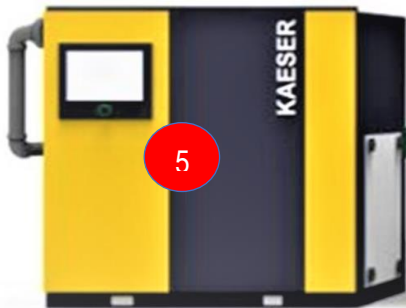
Air compressor & air filter