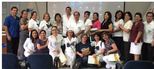
The Community Action Board brings together expertise from all parts of the cancer care system in La Libertad, Peru.

In July 2016 PATH received significant funding to scale-up this successful model for breast cancer screening in nine health networks in Trujillo, La Libertad. The new project aims to train 30 health promoters in breast health education and patient navigation, 300 midwives in clinical breast exam (CBE), and 12 hospital doctors in CBE, breast ultrasound, and FNA sampling.