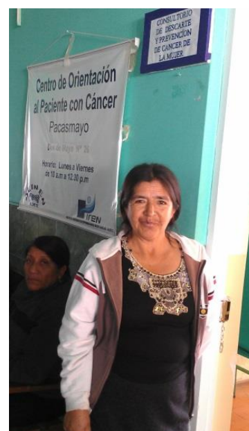
A woman waits for a breast exam in La Libertad, Peru

In 2011, we initiated a collaborative pilot demonstration of a model of care to improve access to and quality of breast cancer screening, diagnosis, and referral services. Notable results from this project include: