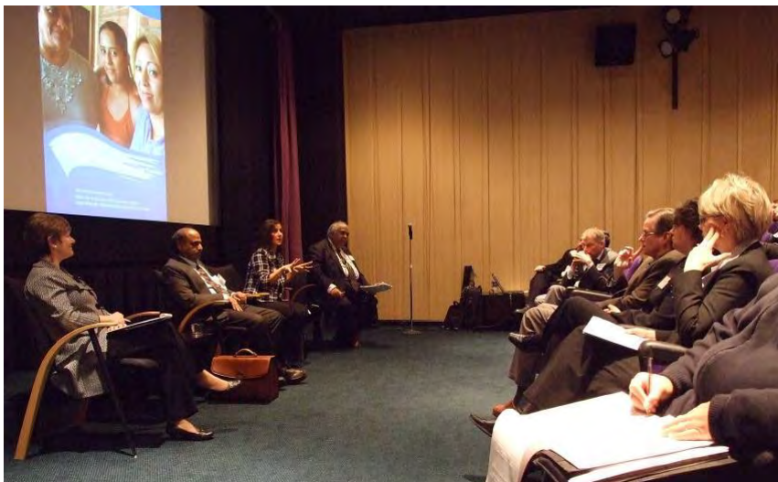
ACCP partners present the “10 Key Findings and Recommendations” at a Washington, DC dissemination event in 2008

(especially the HPV test group) than in the delayed treatment group. Specifically, by 12 months, CIN 2+ had been diagnosed among 1.4% (95% CI: 0.87–1.97) of women in the HPV arm, 2.9% (95% CI: 2.12–3.69) in the VIA arm and 5.4% (95% CI: 4.31–6.50) in the delayed evaluation group. No adverse treatment results were identified and the authors concluded that both screen-and-treat approaches are safe and effectively reduce disease occurrence. 35