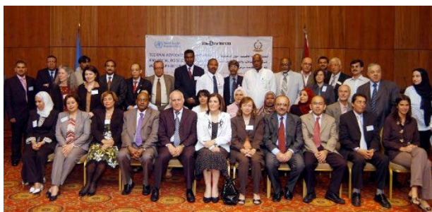
EMR workshop participants, April 13–17, 2008, Amman, Jordan