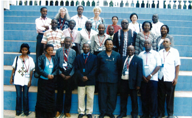
AFR workshop participants, September 8–12, 2008, Kampala, Uganda