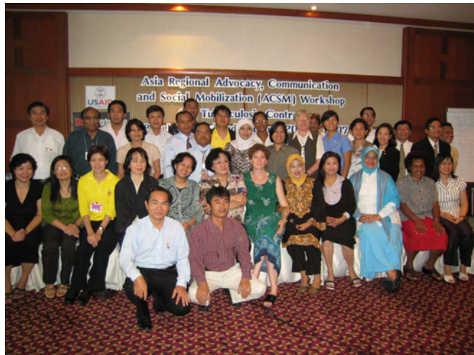
WPR/SEAR workshop participants, August, 20–24, 2007, Bangkok, Thailand

A key benefit of the workshop from the facilitators' viewpoint was the dialogue and common understanding it created within each country team—many team participants had not worked together previously and had different understandings of the status of their country ACSM activities before they came to the workshop. The workshop provided an opportunity to build a support network for moving ACSM activities forward when participants returned home.