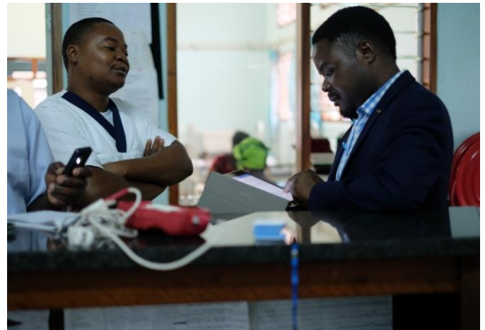
Digital tools like CDSAs can help health workers make more accurate diagnoses and deliver more targeted care.

Despite several initiatives underway around the use of these digital tools in low-resource settings, there remains a lack of awareness of their impact and cost-effectiveness at the national level, as well as a growing need to streamline how health data is collected and used for decision-making. Though more research is needed, initial evidence suggests that CDSAs can reduce barriers to quality of care and, ultimately, health disparities, leading to greater health impact.