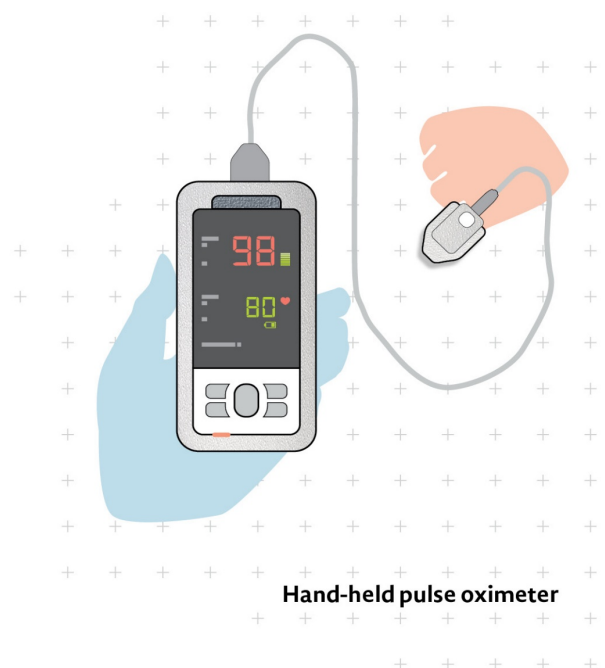
Hand-held pulse oximeter

To learn more about TIMCI, please contact TIMCI@path.org .