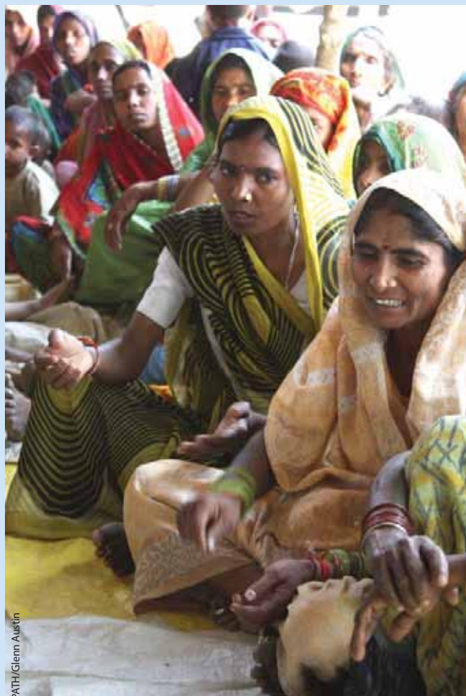
Self-help groups can provide women with health information as well as alternative financing for household products.

NGOs, microfinance institutions (MFIs), and corporate manufacturers of HWTS products can play an important role in creating awareness of the link between safe water and good health and in promoting community or household water treatment. Influential community members, including the Panchayat health workers, and leaders of self-help groups, can help disseminate the message and catalyze household decision-making regarding HWTS.