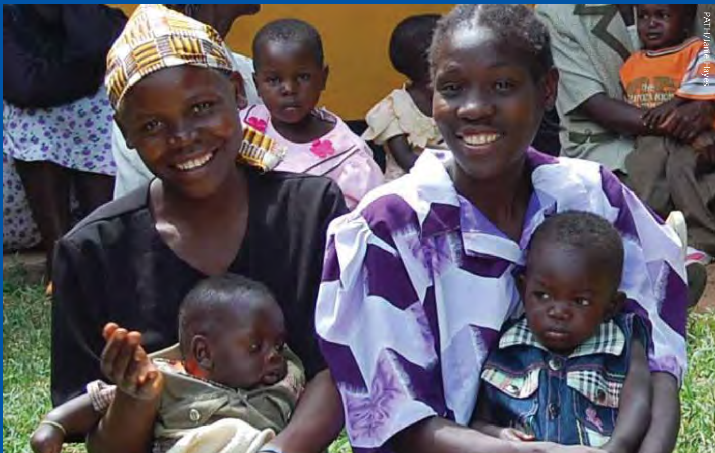
Mothers wait to have their children seen at Webuye Health Clinic in Kenya's Western Province.

Keeping the promise: united to achieve the Millennium Development Goals, UNGA resolution, 17 September 2010 1